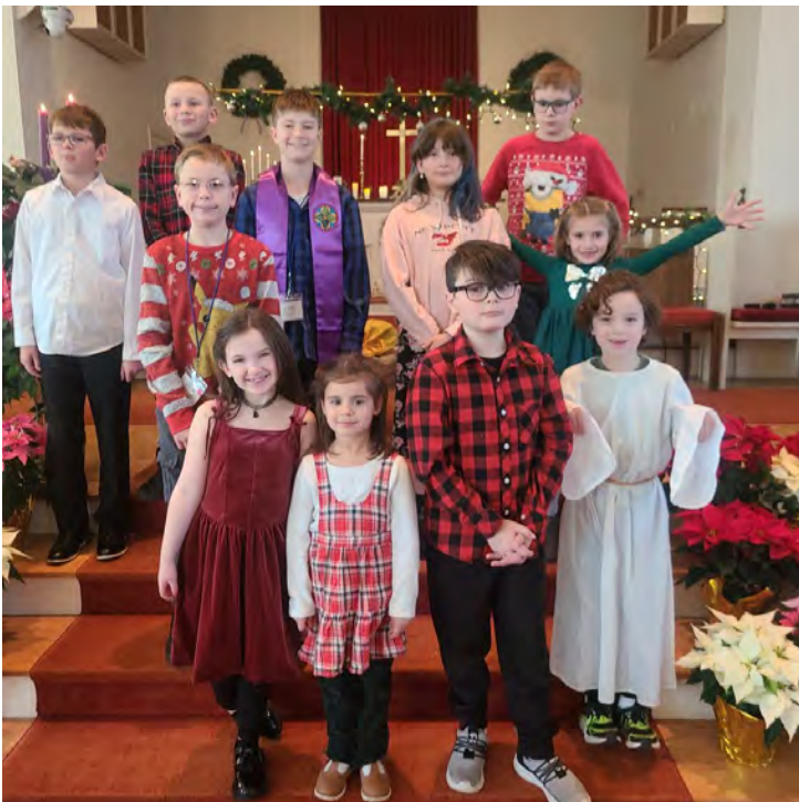
The Kids Church Christmas pageant was held on Sunday, December 21. Pictured here are the amazing kids that participated.